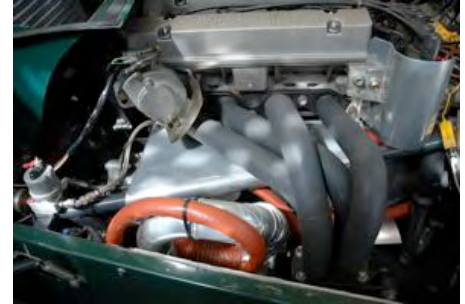
Turbo hidden there!