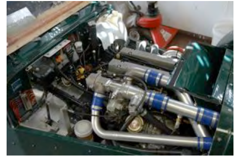
Lots of plumbing