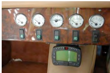
Old fashioned dial instruments with hi-tech performance tool