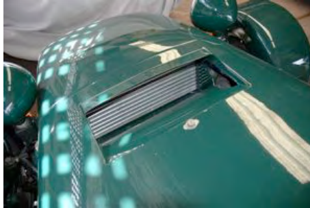
One of two intercoolers

4agze supercharger with water cooled turbocharger (complete with Haltec computer). Note: Twin charger kit worth $6,000 by itself. Gearbox is later model T50 with Albins close ratios