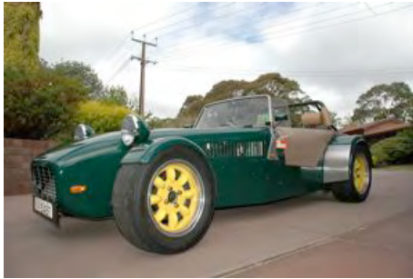
Tyres & Wheels Dunlop formula 195*60 front & 225*50 rear