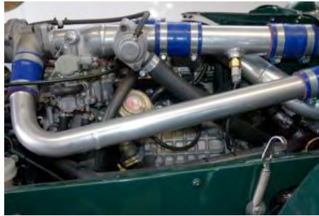
Standard supercharger and standard pulley