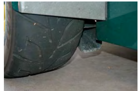
Duct work to rear brakes