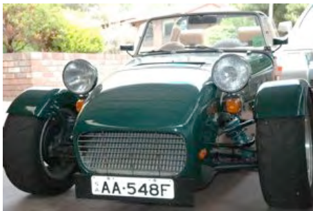
Volvo 4 spot disc brakes